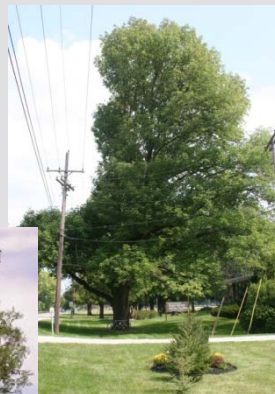
This ash tree is not planted on the right site. It will require maintenance to keep it clear of power lines.