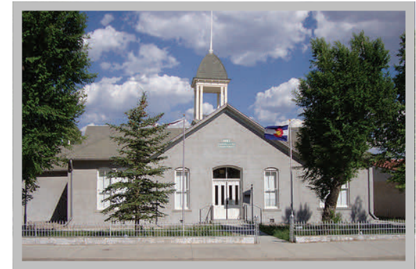
Colorado's First Courthouse