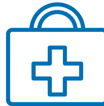
Emergency Care & Urgent Care