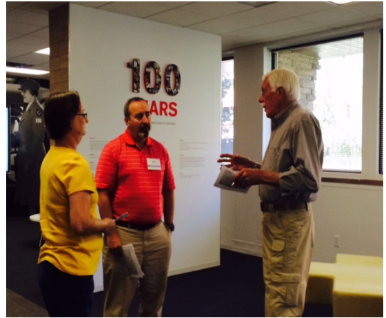
Disaster Spiritual Care Trainers practice providing care in a classroom setting.