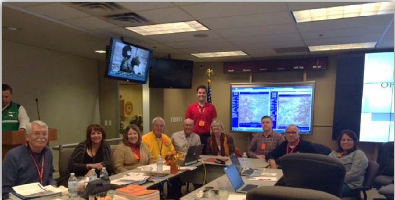
COVOAD Members and State Employees work together in the EOC exercise

DHSEM is working with governments, private-nonprofit organizations, and other critical partners on the following mitigation and recovery efforts.