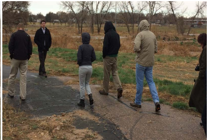
On March 25, 2015, Mitigation and Recovery staff visited the City of Evans to conduct site inspections for Public Assistance projects and answer questions.