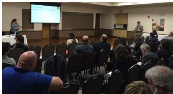
The City of Evans held a public hearing on April 15, 2015 to receive input to the State’s amendment to the current Community Development Block Grant – Disaster Recovery (CDBG-DR) Action Plan.