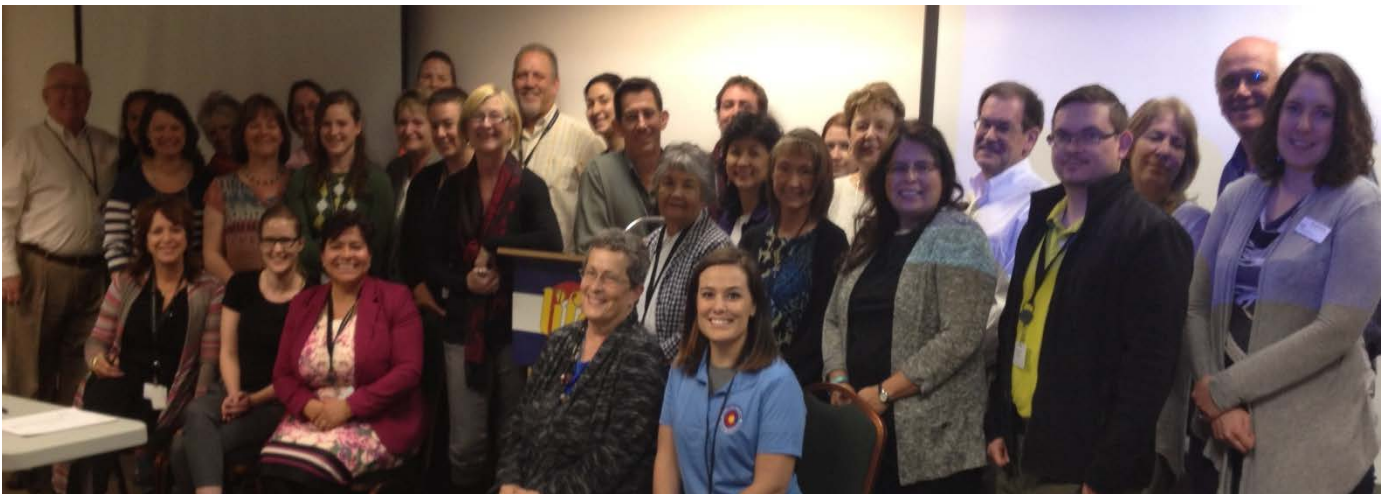
On April 23, 2015 Catholic Charities held a state-wide Disaster Case Management Program training session.

DHSEM is coordinating the following mitigation and recovery efforts with government, private-nonprofit organization, and other critical partners.