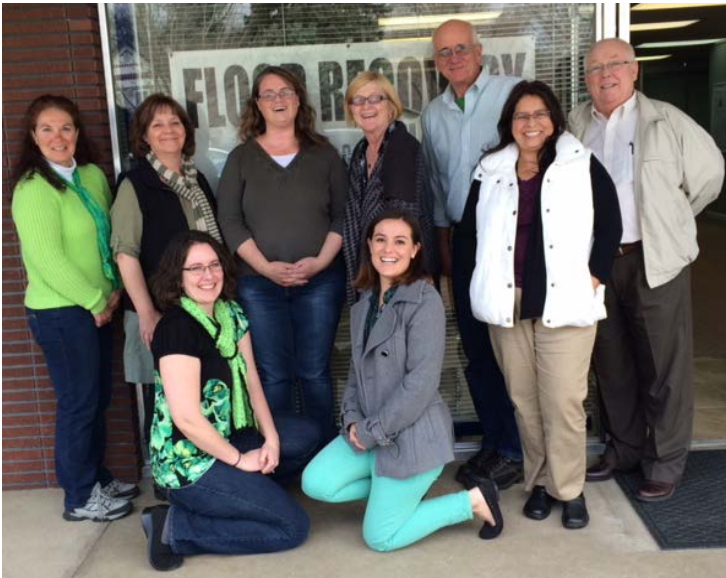
Larimer Long Term Recovery Group

and utilization of the Coordinated Assistance Network (CAN) were reviewed. The dedication and commitment of staff to serving their clients was clearly evident in both counties. The team will visit the Boulder Long Term Flood Recovery Group office in Longmont on April 2, 2015.