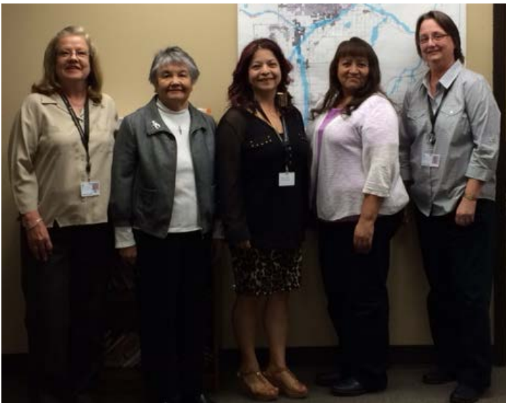
Weld Recovers Group