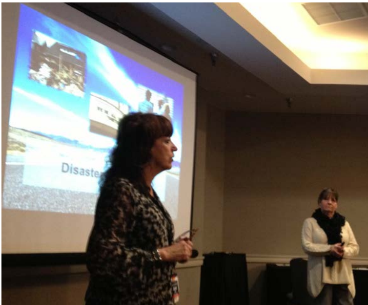
The Disaster Case Management Program was highlighted in two sessions of the 2015 Emergency Management Conference.