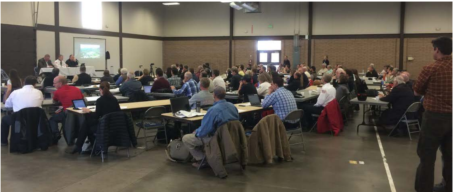
The Lessons Learned: 2013 Front Range Disasters workshop held on January 29, 2015 identified lessons learned, challenges and other valuable experiences taken from the response to and recovery from large disasters.