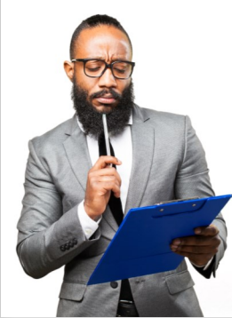
Designed by Asierromero - Freepik.com