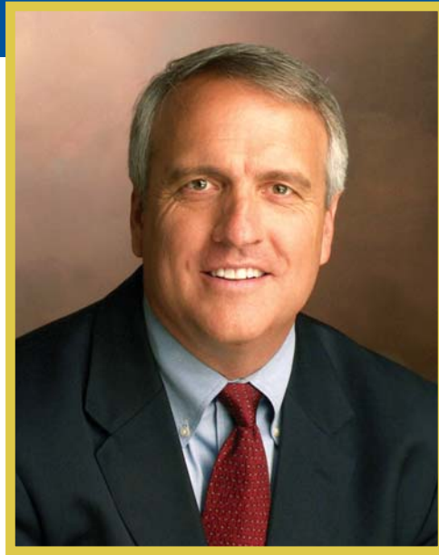
Bill Ritter, Jr. Governor