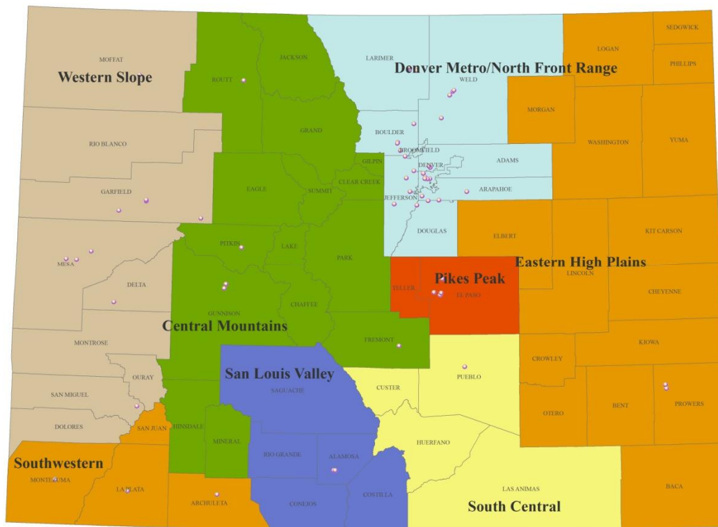
Figure 1. Monitoring Regions in Colorado

The state has been divided into eight multi-county areas that are generally based on topography and have similar airshed characteristics. These areas are the Central Mountains, Denver Metro/North Front Range, Eastern High Plains, Pikes Peak, San Luis Valley, South Central, Southwestern, and Western Slope regions. Figure 1 shows the approximate boundaries of these areas.